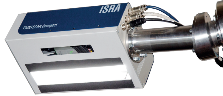
PAINTSCAN Compact sensor

The new solution for paint inspection combines a powerful classification pipeline, which defines the type and relevance of the detected errors and is used to generate process-relevant quality data during the inspection. For example, craters are differentiated from other types of defects to indicate process problems should the defect always occur at similar locations on the painted part. There is also the option of setting specific tolerances for individual zones (hood, roof, etc.). An example here are defects on primary surfaces that are directly in the customer's line of sight or on secondary surfaces (e.g., roof, frame) with medium to high priority, as well as defects on parts that are usually out of the customer's line of sight.